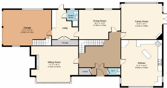
Ground Floor Approximate Floor Area 2,271 sq. ft. (211.0 sq. m.)