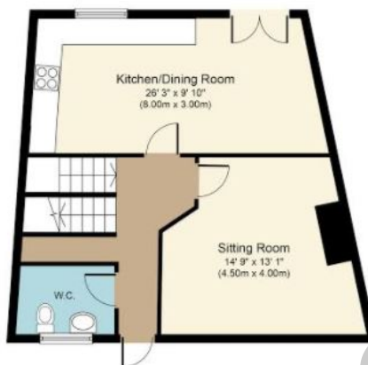
Ground Floor Approximate Floor Area 538 sq. ft. (50.0 sq. m.)