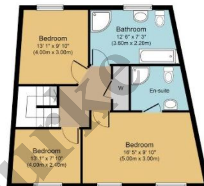
First Floor Approximate Floor Area 538 sq. ft. (50.0 sq. m.)